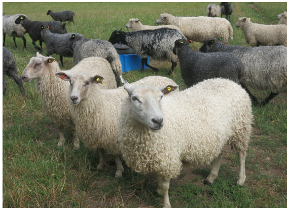
Typical Swedish Leicesters

Pigmentation. This is quite variable on the sheep I have seen. In general they are quite spotty on the face. Some ewes can have very good pigmentation on the ears and around the eyes, exhibiting the true 'blue' colour the