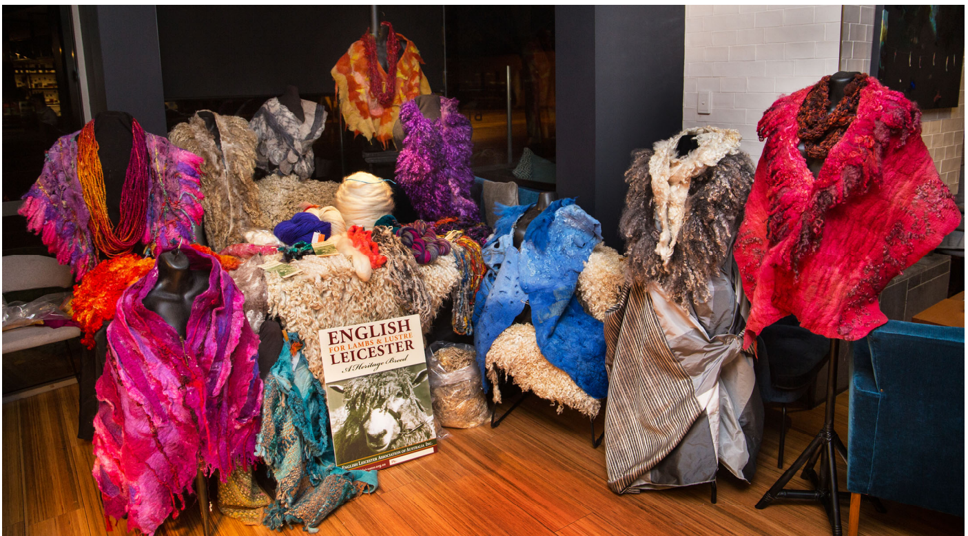
Dinner guests were treated to an impressive display of English Leicester craftwork.

12-14 St John Street, Launceston, Tasmania, Australia 7250 +61 (0)3 6333 7522 www.bluestonebarkitchen.com.au